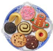
Village Information Center Shelburne Falls

Moonlight Magic Shelburne Falls Area Women's Club Cookie Shop 4:00 - 9:00p.m.