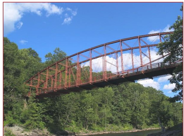
Bardwell's Ferry Bridge

The beautiful one-lane parabolic truss bridge on Bardwell's Ferry Road that crosses the Deerfield River between Shelburne and Conway has been closed indefinitely due to structural deficiencies discovered at the entrance on the Conway side. The bridge is jointly owned by Shelburne and Conway. The Town of Conway is investigating grant options for repairs estimated at $500,000.